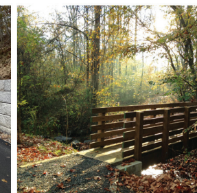
Doe Run Park