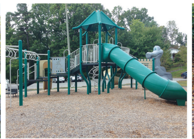
Collinsville Jaycee Park